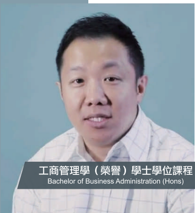
工商管理學（榮譽）學士學位課程 Bachelor of Business Administration (Hons)