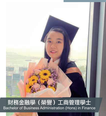
財務金融學（榮譽）工商管理學士 Bachelor of Business Administration (Hons) in Finance