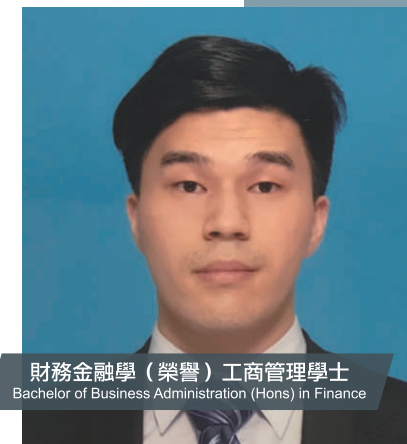
財務金融學（榮譽）工商管理學士 Bachelor of Business Administration (Hons) in Finance