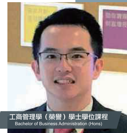
工商管理學（榮譽）學士學位課程 Bachelor of Business Administration (Hons)