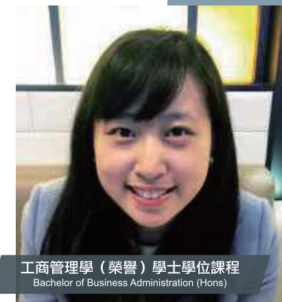
工商管理學（榮譽）學士學位課程 Bachelor of Business Administration (Hons)