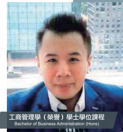
工商管理學（榮譽）學士學位課程 Bachelor of Business Administration (Hons)

2011年畢業（一級榮譽），成立“Gebecert Ltd.”公司並出任CEO。