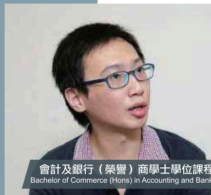
會計及銀行（榮譽）商學士學位課程 Bachelor of Commerce (Hons) in Accounting and Banking