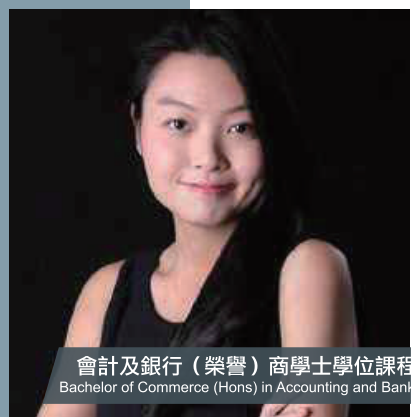
會計及銀行（榮譽）商學士學位課程 Bachelor of Commerce (Hons) in Accounting and Banking