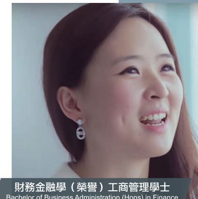
財務金融學（榮譽）工商管理學士 Bachelor of Business Administration (Hons) in Finance