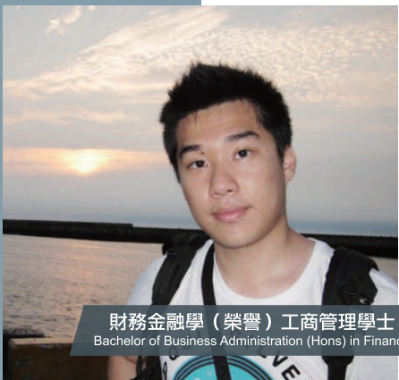
財務金融學（榮譽）工商管理學士 Bachelor of Business Administration (Hons) in Finance