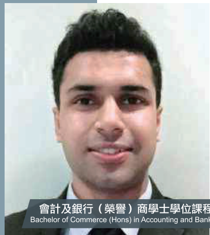
會計及銀行（榮譽）商學士學位課程 Bachelor of Commerce (Hons) in Accounting and Banking