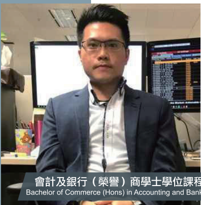
會計及銀行（榮譽）商學士學位課程 Bachelor of Commerce (Hons) in Accounting and Banking