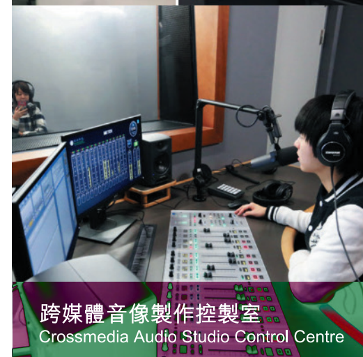
跨媒體音像製作控制室 Crossmedia Audio Studio Control Centre