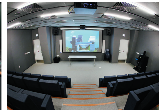
跨媒體播放室 Crossmedia Screening Suite