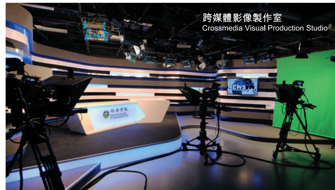
跨媒體影像製作室 Crossmedia Visual Production Studio