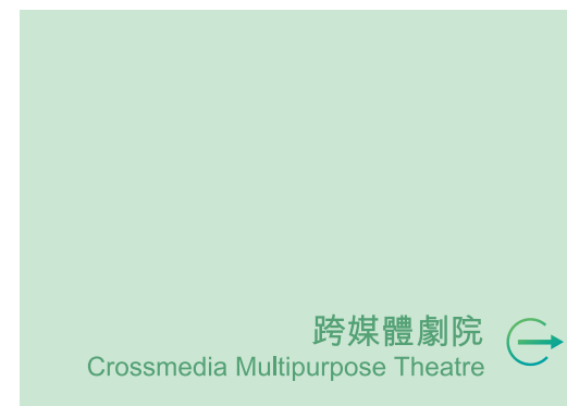
跨媒體劇院 Crossmedia Multipurpose Theatre